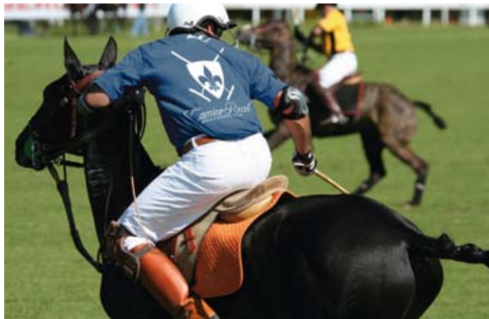
Polo lovers will find it easier to get close to the Argentinian action

BRITISH owners of second homes in Argentina will benefit from a new route to Buenos Aires being launched by British Airways on March 27. Previously, BA flights to the capital, often dubbed the 'Paris of South America', were routed through São Paulo, but passenger demand has encouraged the airline to set up a daily non-stop service from London. An increase in tourism numbers is having a positive effect on Argentina's housing market, which was identified as a 'future high-growth luxury residential market' by the Knight Frank Global Property Wealth Survey 2010 and one of the 'most favourable destinations' for hotel investment in 2011 by Jones Lang LaSalle. Coming online this year are the apartment-hotel rooms at the five-star Camino Real Polo & Country Club, located 35 minutes from Buenos Aires. Guide prices start from £87,500, which includes an annual stay of two weeks with free polo lessons (020-7321 5858; www.experience-international.com ).